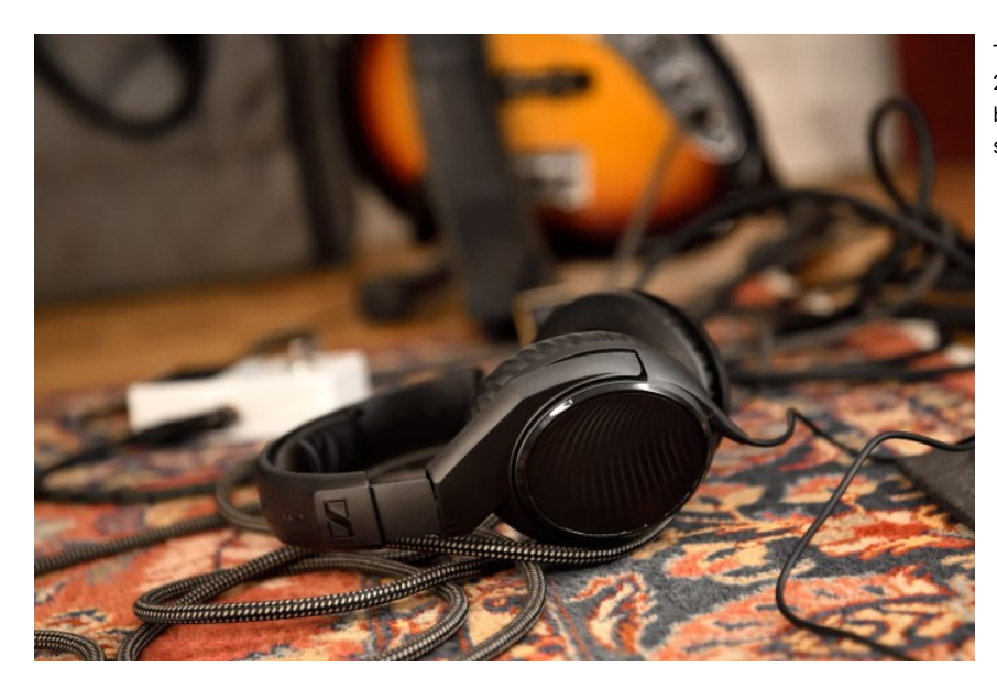
The rugged HD 200 PRO play back powerful studio sound

and exceptionally dynamic, they make every creative task a pleasure and have been designed for comfort over long periods of use.