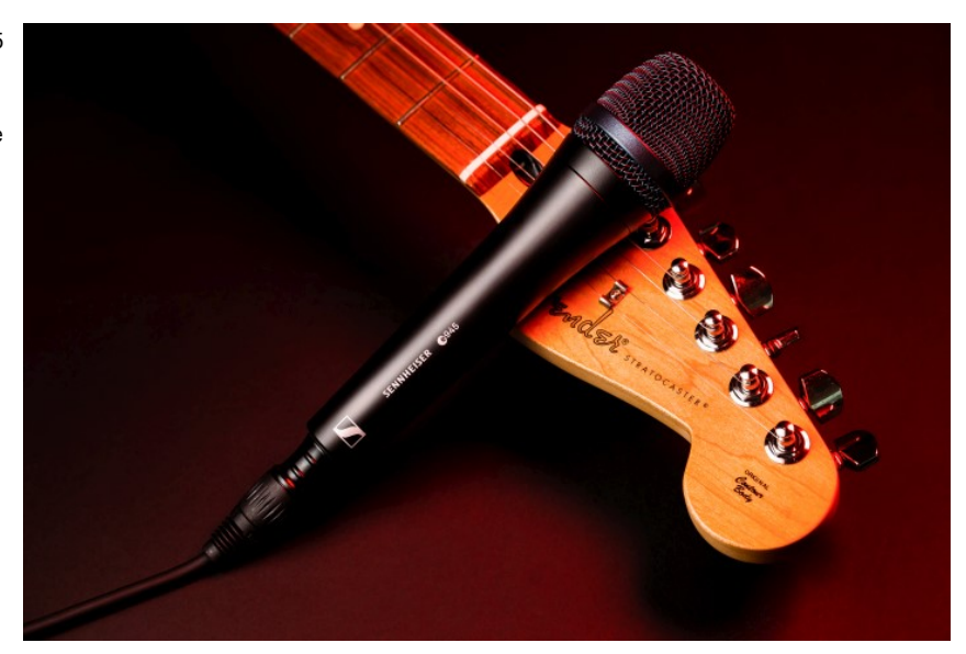
The dynamic e 935 and e 945 microphones help to make your voice stand out with impressive intensity

This pair of vocal mics provide a step up in quality and extreme durability that can capture vocals with impressive intensity – even on louder stages. Like the e 835 and e 845 siblings, Sennheiser offers two related mics – the cardioid <u>e 935</u> and the super-cardioid <u>e 945</u> with a narrower pick-up pattern – which are both great for giving vocals more space with loud instruments, with their versatile and balanced frequency response suited to every genre of music. With a transparent high-end and warm but well-defined lower mids, even gentle voices have an impressive intensity and size, and vocal tracks in the band mix can be emphasized more easily. Both mics are extremely resistant to feedback as well as to the hard conditions of live gigs.