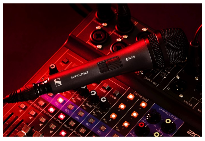
The e 835 is Sennheiser's bestselling vocal microphone – available with or without on/off switch

Sennheiser's best-selling <u>e 835</u> and <u>e 845</u> are dynamic cardioid and super-cardioid microphones that are perfectly suited to vocals. They project well and cut through high volumes on stage but are also great for home recording and semi-pro studios. Making vocals come alive, these are popular mics for crystal clear and natural sound without feedback, spill or handling noise. Their extremely durable metal construction means they're able to take on the knocks of a life of performing. Close siblings, these mics share much in common but the super-cardioid pick-up pattern of the e 845 is better at rejecting noise from the side. Considering their amazing quality, these mics are excellent value for money.