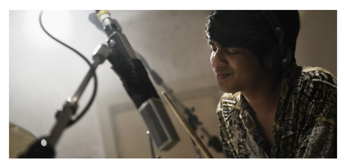
The Perfect Gifts for Musical Fathers

Making and recording music with professional tools